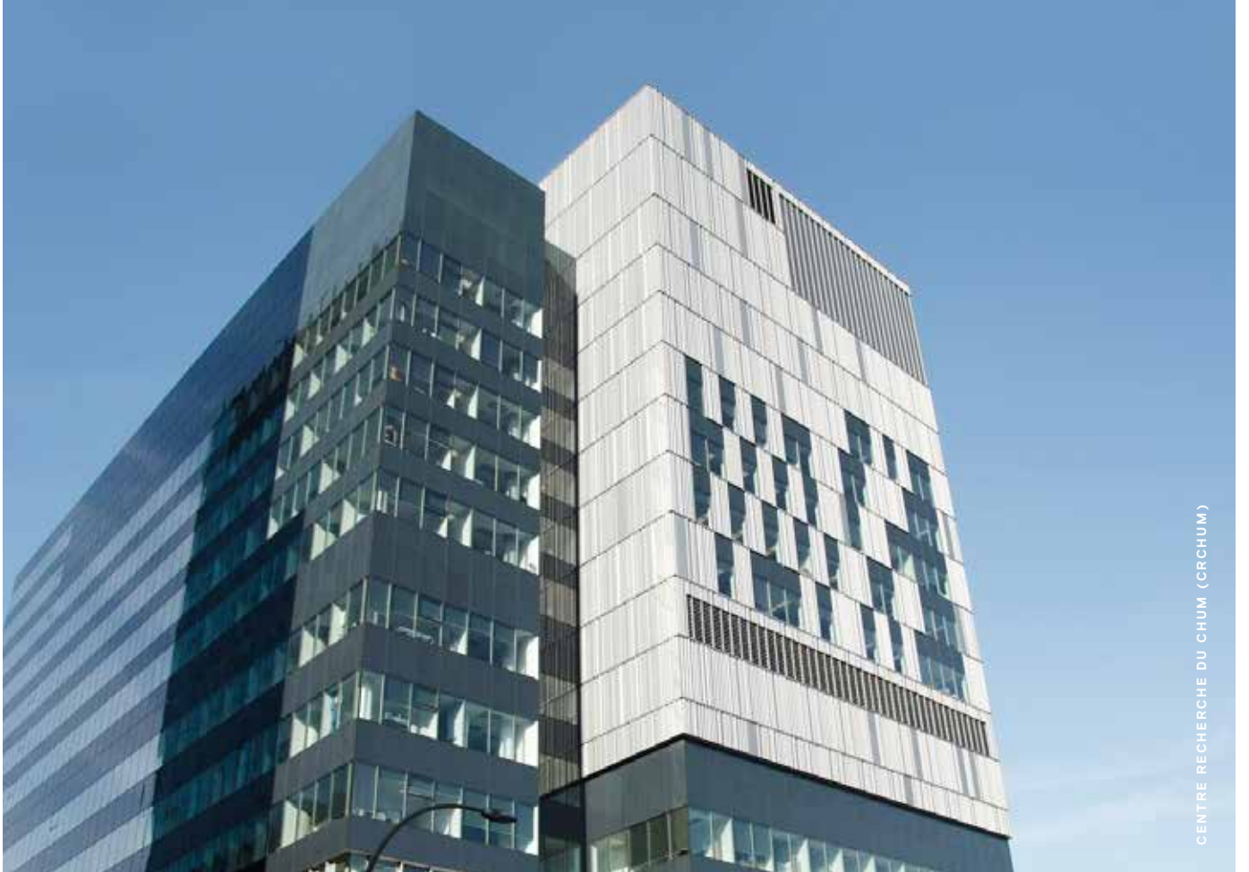
CENTRE RECHERCHE DU CHUM (CRCHUM)